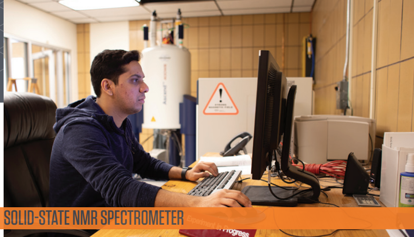
SOLID-STATE NMR SPECTROMETER

The state-of-the-art instrument now serves the entire S&T science community and supports medical research on antioxidant-based treatments for age-related cataracts with Nuran Ercal and functionalized nanodiamonds as drug delivery vehicles with Vadym Mochalin in chemistry.